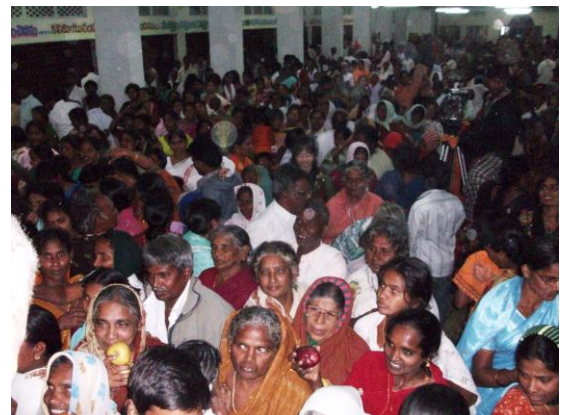
By conference end, wall-to-wall people inside with as many or more outside.