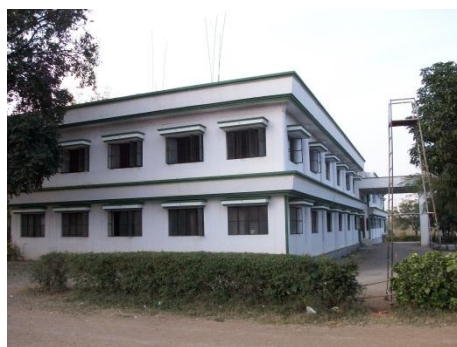
BBC Classroom, Administrative Offices, Library and Chapel Building