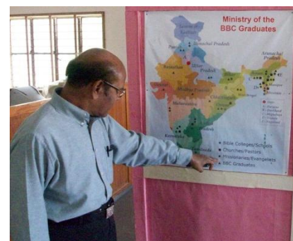
Dr. Buraga exhibits locations of churches planted by BBC graduates.