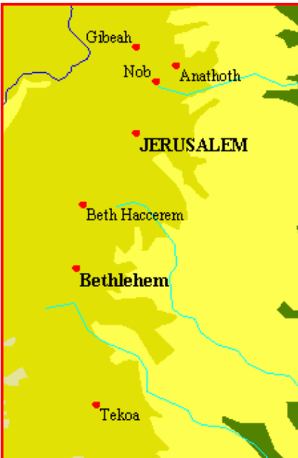
(BKC [OT] p. 1126)