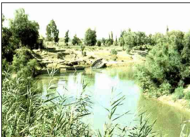
Traditional site for the baptism of Jesus Christ